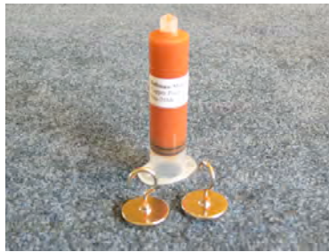
Figure 1. Copper Brazing Paste

A copper braze paste consists of copper powder blended into a neutral suspending agent. The product is a semi-solid consistency, somewhat similar to toothpaste.